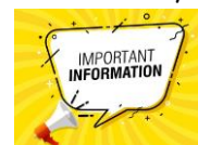
Summer Term 2 (after May half term)

A reminder that there is always a great deal of information in the form of posters at the very end of our newsletters (after the school dates). Please read until the end so you don't miss anything.